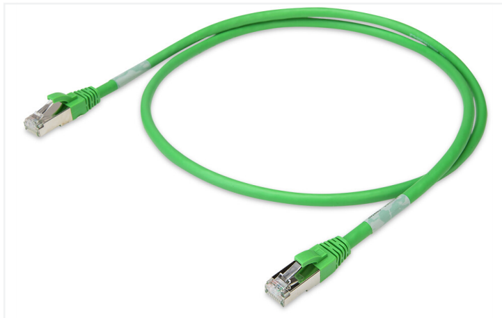
Color: ■ green