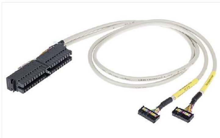
Similar to illustration