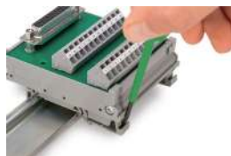
Removing a module from the DIN-rail.