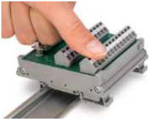
Snapping a module onto DIN-rail.