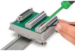
Conductor termination – screwdriver actuation parallel to conductor entry