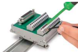
Conductor termination – screwdriver actuation parallel to conductor entry