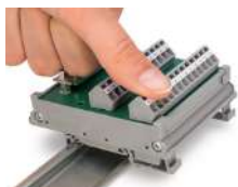
Snapping a module onto DIN-rail.