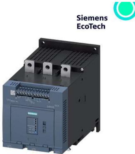
SIRIUS soft starter 200-480 V 370 A, 110-250 V AC Screw terminals Analog output