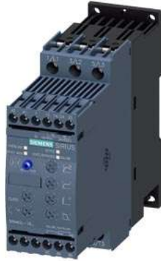
SIRIUS soft starter S0 25 A, 11 kW/400 V, 40 °C 200-480 V AC, 110-230 V AC/DC Screw terminals