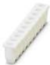
Insulating sleeve, color: white

https://www.phoenixcontact.com/in/products/3002843