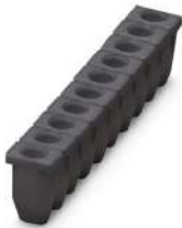
Insulating sleeve, color: black

https://www.phoenixcontact.com/in/products/3002869