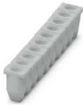
Insulating sleeve, color: gray

https://www.phoenixcontact.com/in/products/3002856