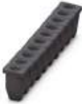
Insulating sleeve, color: black

https://www.phoenixcontact.com/in/products/3002869