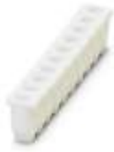
Insulating sleeve, color: white

https://www.phoenixcontact.com/in/products/3002843