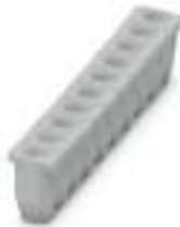
Insulating sleeve, color: gray

https://www.phoenixcontact.com/in/products/3002856