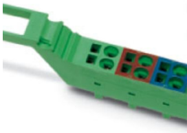
Inline connector, colored

https://www.phoenixcontact.com/in/products/2727608