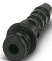
Pneumatic pin, for HC-M-PN3 module, internal hose diameter of 4.0 mm

https://www.phoenixcontact.com/in/products/1663501