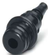
Pneumatic pin, for HC-M-PN3 module, internal hose diameter of 3.0 mm

https://www.phoenixcontact.com/in/products/1663491