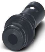
Pneumatic pin, for HC-M-PN3 module, internal hose diameter of 1.6 mm

https://www.phoenixcontact.com/in/products/1663488