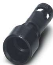
Pneumatic socket, for HC-M-PN3 module, internal hose diameter of 1.6 mm

https://www.phoenixcontact.com/in/products/1663514