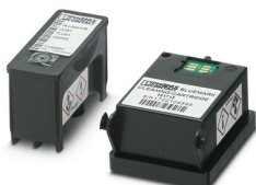
Cartridge, for replacement, 20 ml UV color, black, including cleaning cartridge

https://www.phoenixcontact.com/in/products/5146662