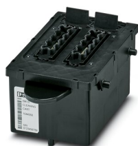
Replacement cleaning cartridge

https://www.phoenixcontact.com/in/products/1044350