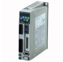
R88D-GT08H G-Series servo drive, 1~200 VAC, Analog/Pulse input type, 800 W