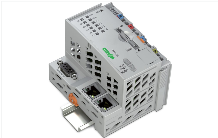
Color: ■ light gray