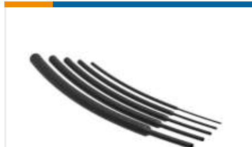
TE Part #NB13524001 RNF-100-3/8-BK-SP