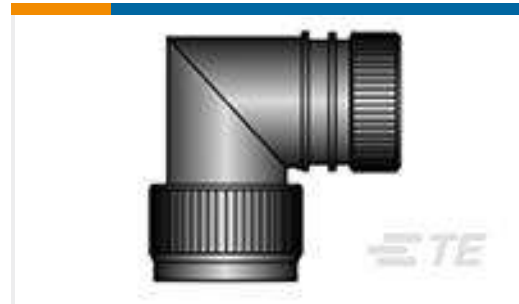
TE Part #289359-000 HEX40-AC-90-11-A2-1