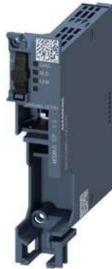
communication module Modbus TCP