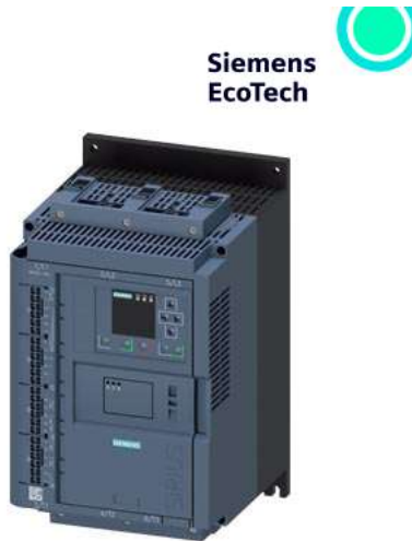
SIRIUS soft starter 200-480 V 47 A, 110-250 V AC spring-type terminals