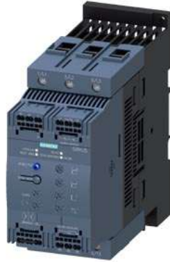
SIRIUS soft starter S3 106 A, 55 kW/400 V, 40 °C 200-480 V AC, 24 V AC/DC spring-type terminals