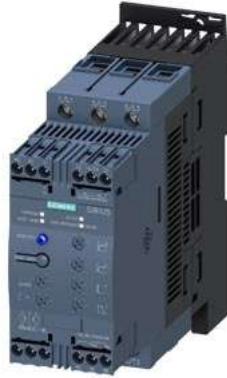
SIRIUS soft starter S2 72 A, 37 kW/400 V, 40 °C 200-480 V AC, 24 V AC/DC Screw terminals