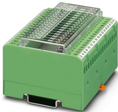
Lamp test module, 2 diodes with common cathode: with 16 pairs, with common triggering

Please be informed that the data shown in this PDF document is generated from our online catalog. Please find the complete data in the user documentation. Our general terms of use for downloads are valid.