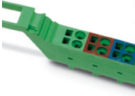
Inline connector, colored

Please be informed that the data shown in this PDF document is generated from our online catalog. Please find the complete data in the user documentation. Our general terms of use for downloads are valid.