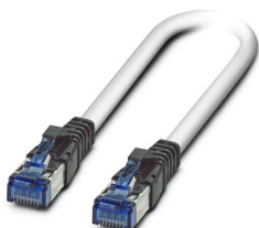
Patch cable, CAT6, pre-assembled, 20.0 m

https://www.phoenixcontact.com/in/products/2891576