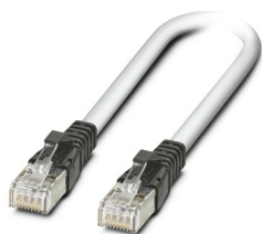
Patch cable, CAT5, assembled, 10 m

https://www.phoenixcontact.com/in/products/2832629