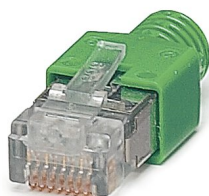
RJ45 connector, design: RJ45, degree of protection: IP20, number of positions: 8, 1 Gbps, CAT5 (IEC 11801:2002), material: Plastic, connection method: Crimp connection, cable outlet: straight, color: green, Ethernet

https://www.phoenixcontact.com/in/products/2744856