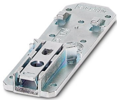
Universal DIN rail adapter

https://www.phoenixcontact.com/in/products/2320089