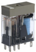
G2R-2-S 12VDC (S) Relay, plug-in, 8-pin, DPDT, 10 A, mech indicator, label facility, 12 VDC