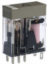
G2R-2-S 220VAC (S) Relay, plug-in, 5 A, mechanical indicator, 220 VAC