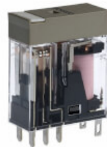
G2R-2-S 230VAC (S) Relay, plug-in, DPST, 10 A, mechanical indicator, 230 VAC