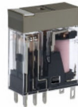
G2R-2-S 240VAC (S) Relay, plug-in, DPDT, 5 A, mechanical indicator, 240 VAC